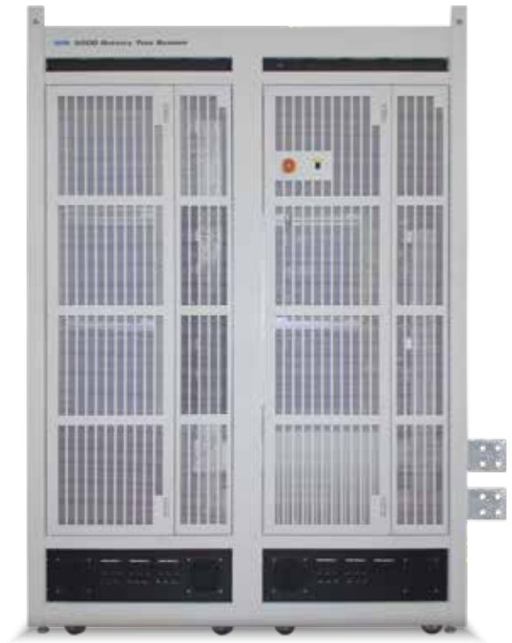
9220 Dual Bay Test System front panel view